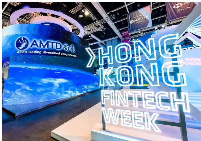
As the sole strategic partner to Hong Kong FinTech Week, AMTD established the AMTD House at the entrance of the conference hall

From establishing the first FinTech school in Hong Kong with PolyU, to partnering with the Hong Kong Trade Development Council on its Start-up Express program to nurture entrepreneurs and promote startups from Hong Kong, submitting proposals to the candidate of The 2022 Hong Kong Chief Executive election, to being the sole strategic partner to the Hong Kong FinTech Week for 4 consecutive years and launching the Hong Kong Youth FinTech Association, AMTD has always been spearheading talent development, especially in FinTech.