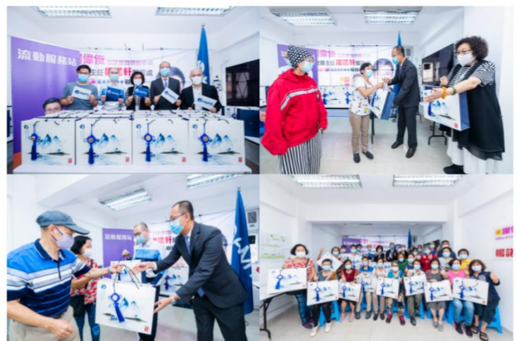
AMTD volunteer team delivered AMTD mooncakes to the locals

Last but not least, AMTD Group respects and supports fundamental human rights. In the company's 'Code of Conduct', we show our care and attention to our employees and key aspects of the company's approach to human rights, by stating clearly the obligations and responsibilities of our employees, and at the same time, ensuring that our staff are provided with safe and suitable work facilities, as well as setting policies to protect workers from workplace harassment.