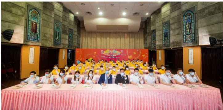
AMTD executives led a team of volunteers to help with the Caritas Charity Show at the call center